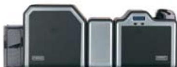
Lamination option and dual-sided printer/encoder